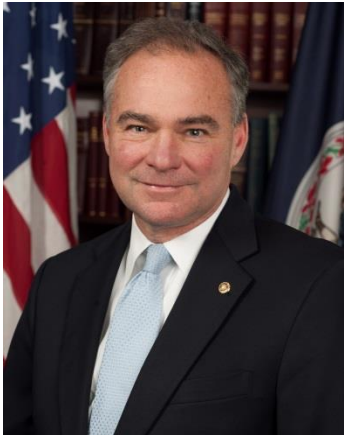
Timothy (Tim) Kaine (D), Richmond term expires 2019

The United States Senate 475 Russell Senate Office Building Washington, DC 20510 Tel. (202) 224-2023 Fax (202) 224-6295 Internet: http://warner.senate.gov