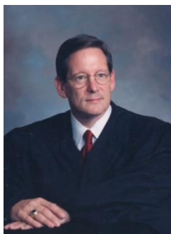
The Honorable Donald W. Lemons, Justice Term expires 2024